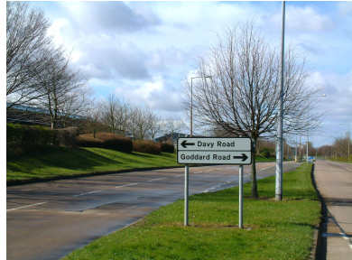
Landscaping Improvement on Davy Road and Astmoor Road