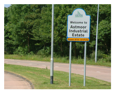
installed prior to arriving on the estate.