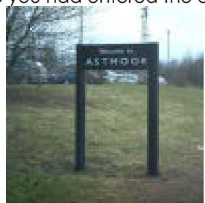
Before – The estate had just one small sign once you had entered the estate