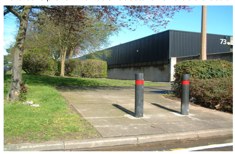
Bollards to prevent vehicular access to vulnerable areas and reduce fly-tipping

Improved access to Business Support Agencies.