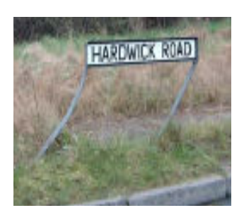
Before – old style name plates, some damaged